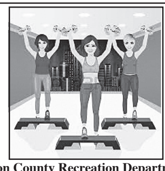
Union County Recreation Department 2018 Evening Step-Aerobics Program Ages: 50 and over

You asked and we listened! Union County Recreation Department is now offering evening fitness classes! If you are looking for an indoor exercise program to fit your work schedule and other needs, then come on down to the Union County Recreation Department and sign up for our new Step-Aerobics program. The Program Director of Union County Parks and Recreation will be leading step-aerobics sessions two times a week for February and March for 45 minutes. This is a great time to socialize and exercise with a fun group for a very low cost. Step-Aerobics Registration begins on January 15, 2018 and ends February 2, 2018 at the Recreation Office (310 Wellborn St.) Registration must be done in person due to class size limits. If you have any questions, please call our office at (706) 439-6074. N(Jan17,M1)SH